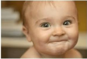
BEFORE TELLING MY CLIENT THE OFFER WAS ACCEPTED